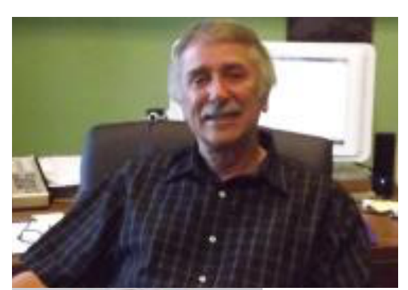
October 2009 - Practical Stuttering Therapy Strategies: Pre K through Adolescence