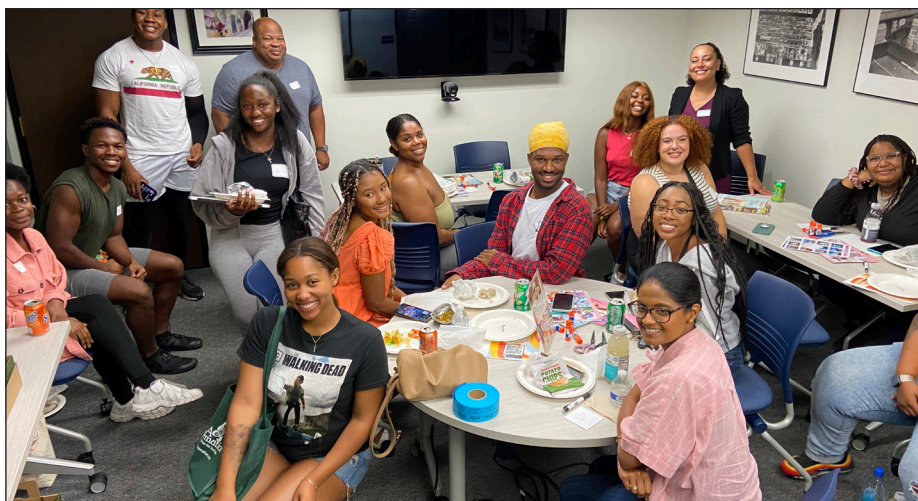
Students attend a Black CommUnity kick-off event in Fall 2023. Black CommUnity is a COMM program aimed at helping Black students find a sense of community in COMM and at CSUF.

Early assessment data shows good results: 100% of mid-year respondents (who attended at least one BCU event) feel a sense of community among the Black students in COMM (versus 30% pre-program); 78% feel connected to Communications faculty and staff (versus 21%